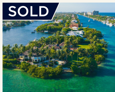
Lighthouse Point, FL Listed at: $22,500,000

John Putzig RE/MAX First 📱 @johnputzigrealtor