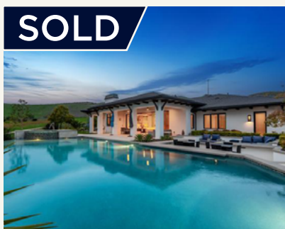
Westlake Village, CA Listed at: $7,495,000