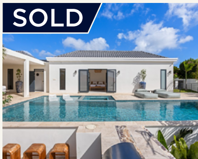
Zuurzak Curacao Listed at: ~$1.2M USD