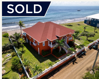
Utila, Bay Island of Honduras Listed at: ~$639,000 USD

Nick Vervoord RE/MAX Bon Bini 📱 @remaxbonbini