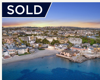
Corona Del Mar, CA Listed at: $6,499,000