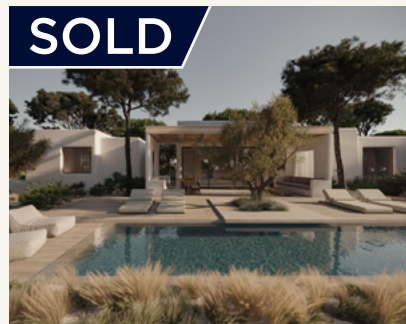
Grândola e Santa Margarida da Serra, Portugal Listed at: ~$3.4M USD